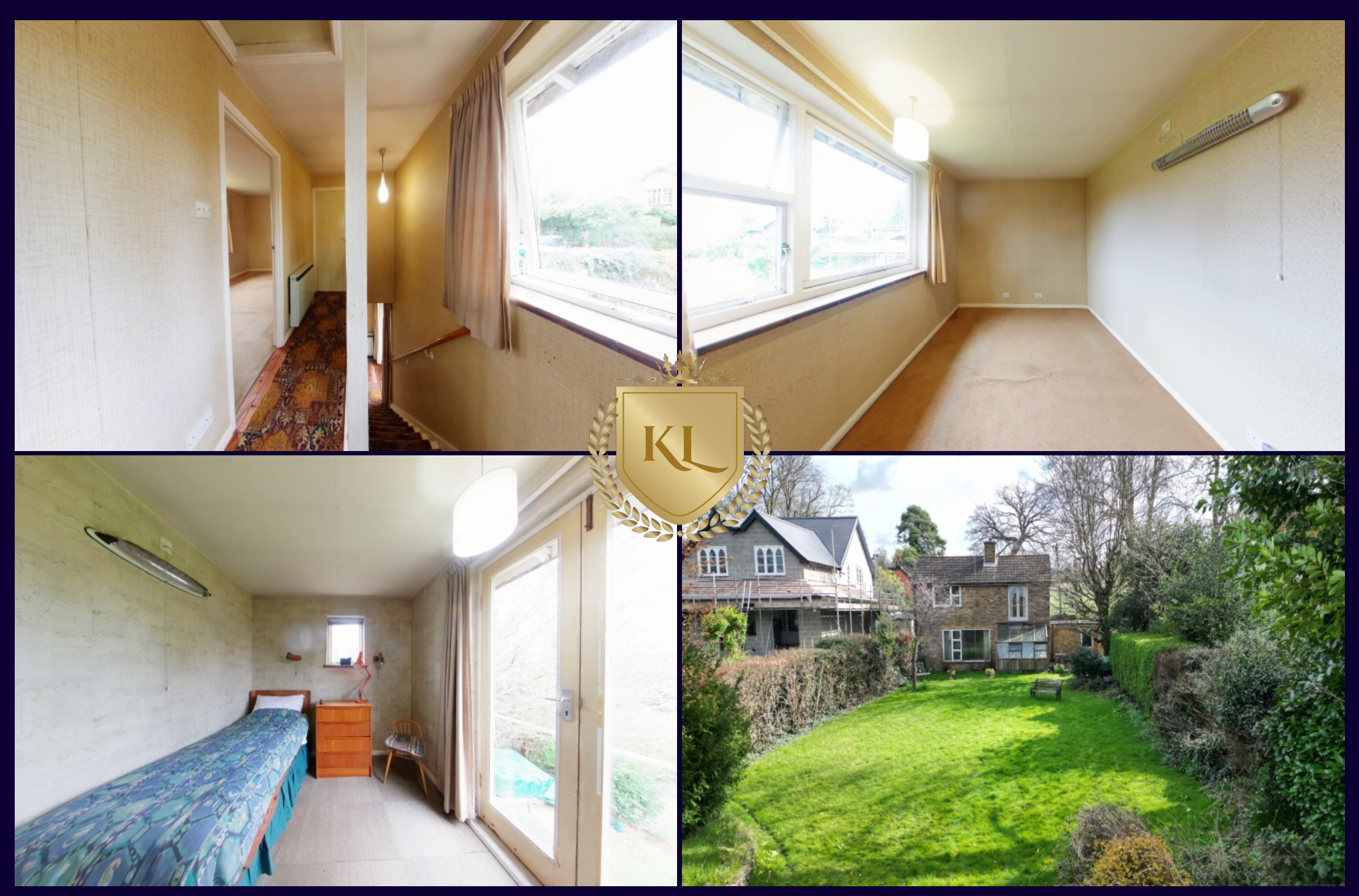
Kings Langley Estates wishes to inform prospective buyers and tenants that these particulars are a guide and act as information only. All our details are given in good faith and believed to be correct at the time of printing but they don't form part of an offer or contract. No employee of the company has authority to make or give and representation or warranty in relation to this property. All fixtures and fittings, whether fitted or not are deemed removable by the vendor unless stated otherwise and room sizes are measured between internal wall surfaces, including furnishings.