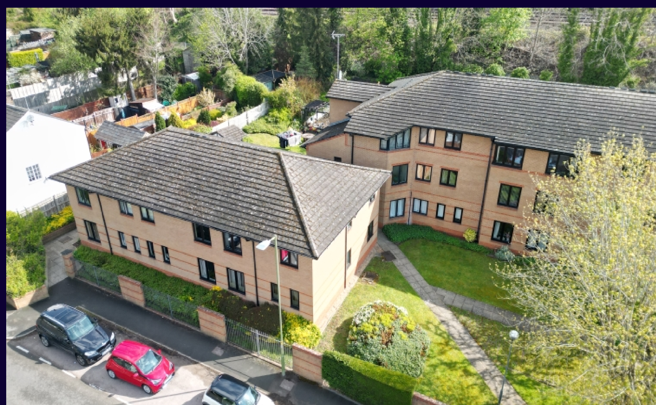
Lake View Railway Terrace, Kings Langley, Hertfordshire, WD4 8JF