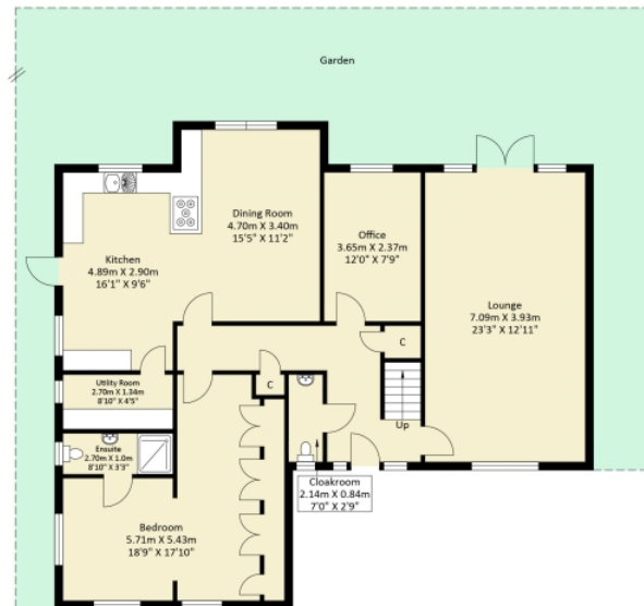
Ground Floor Approximate Floor Area 1214.16 sq. ft (112.8 sq.m)