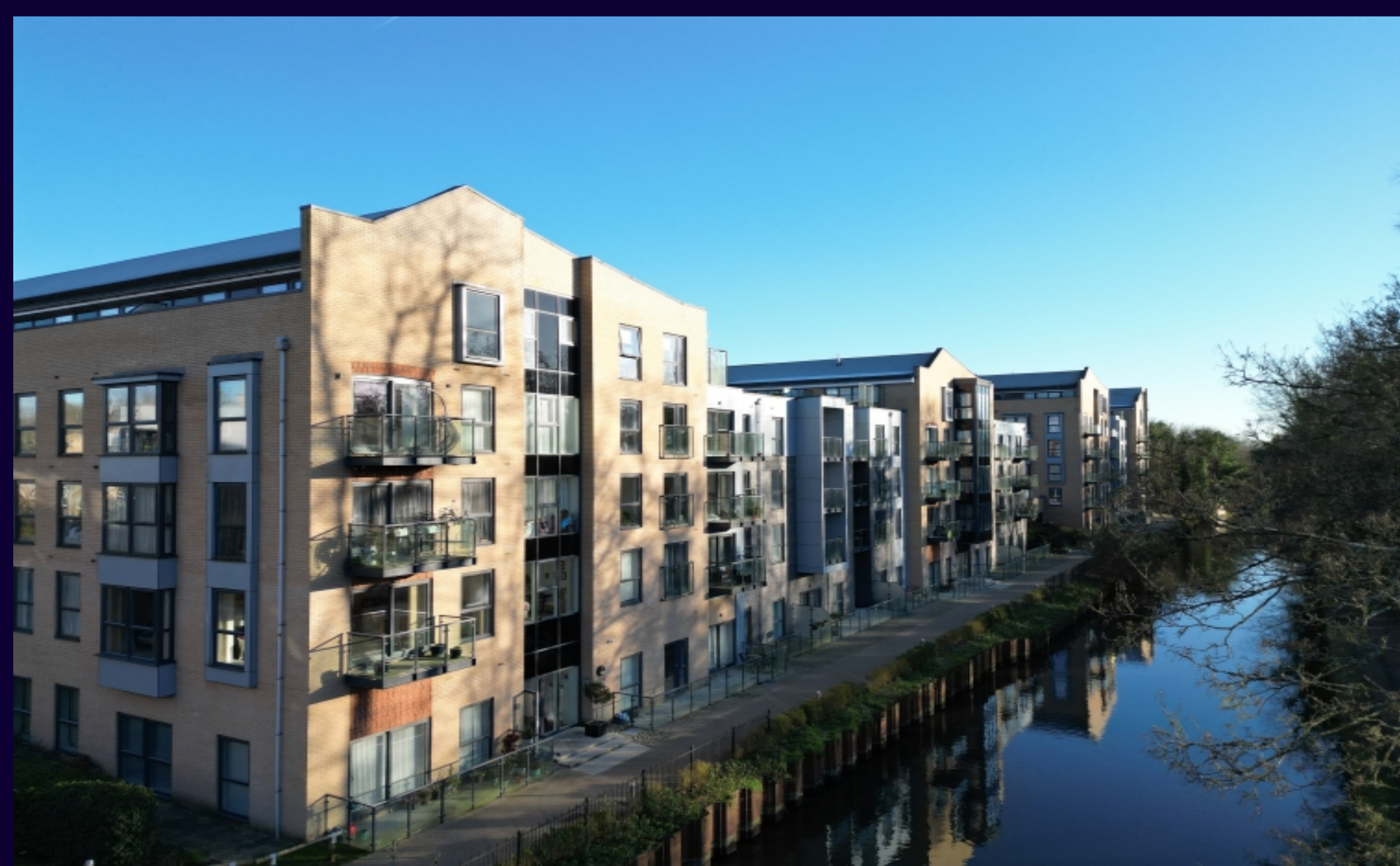
The Embankment, Nash Mills Wharf, Hertfordshire, HP3 9DH