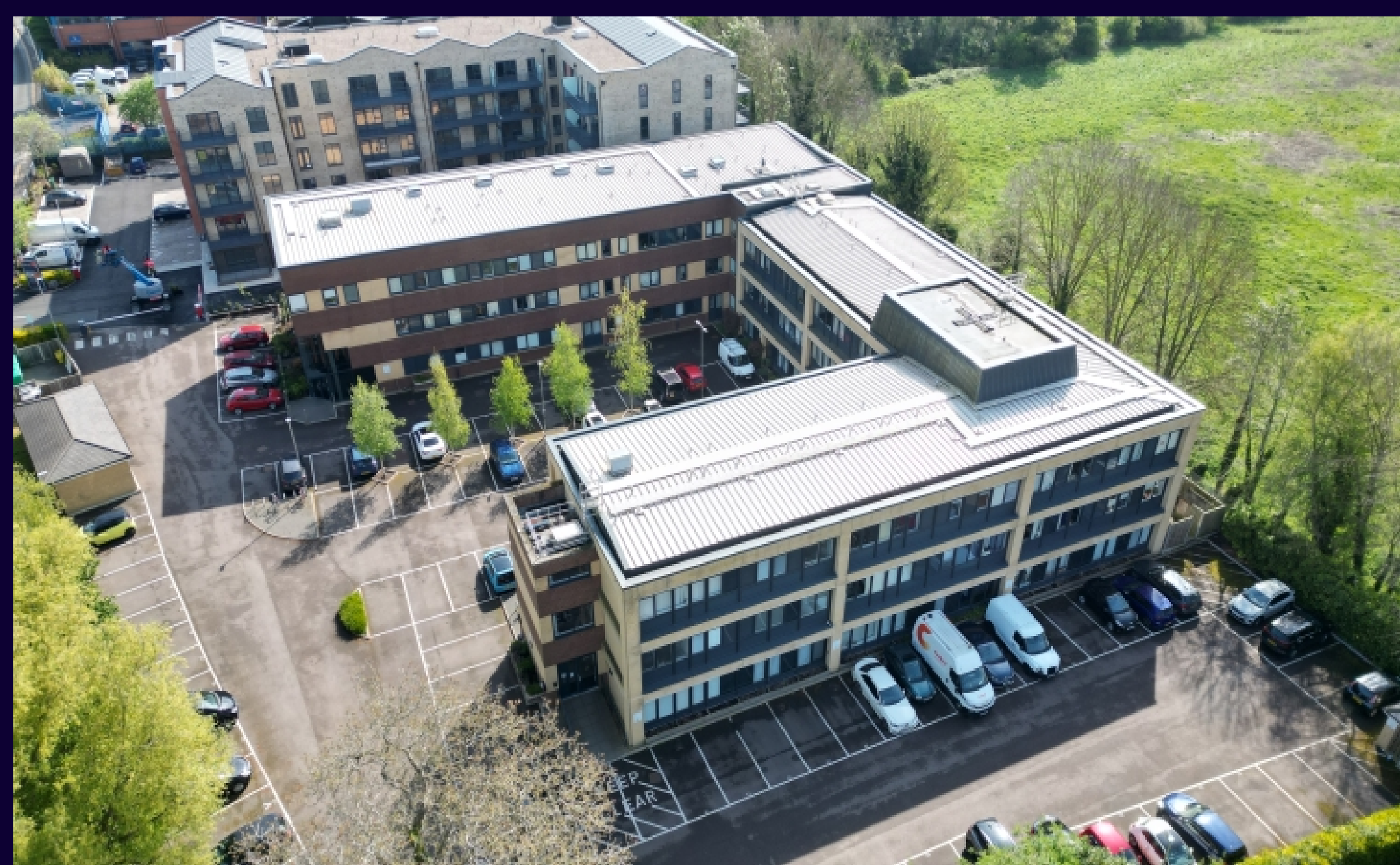
Pinnacle House, Home Park Mill Link, Kings Langley, WD4 8FW