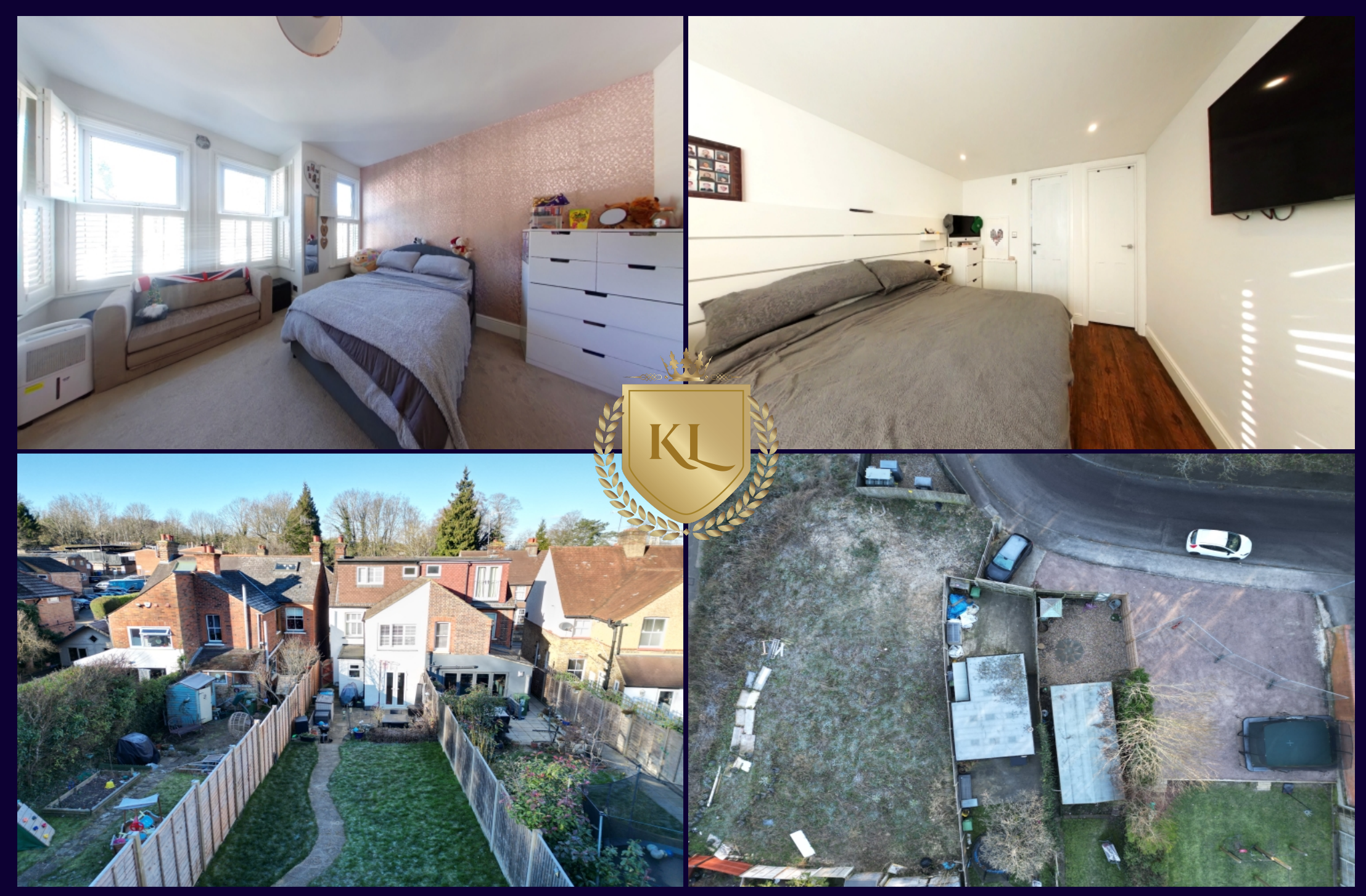
Kings Langley Estates wishes to inform prospective buyers and tenants that these particulars are a guide and act as information only. All our details are given in good faith and believed to be correct at the time of printing but they don't form part of an offer or contract. No employee of the company has authority to make or give and representation or warranty in relation to this property. All fixtures and fittings, whether fitted or not are deemed removable by the vendor unless stated otherwise and room sizes are measured between internal wall surfaces, including furnishings.