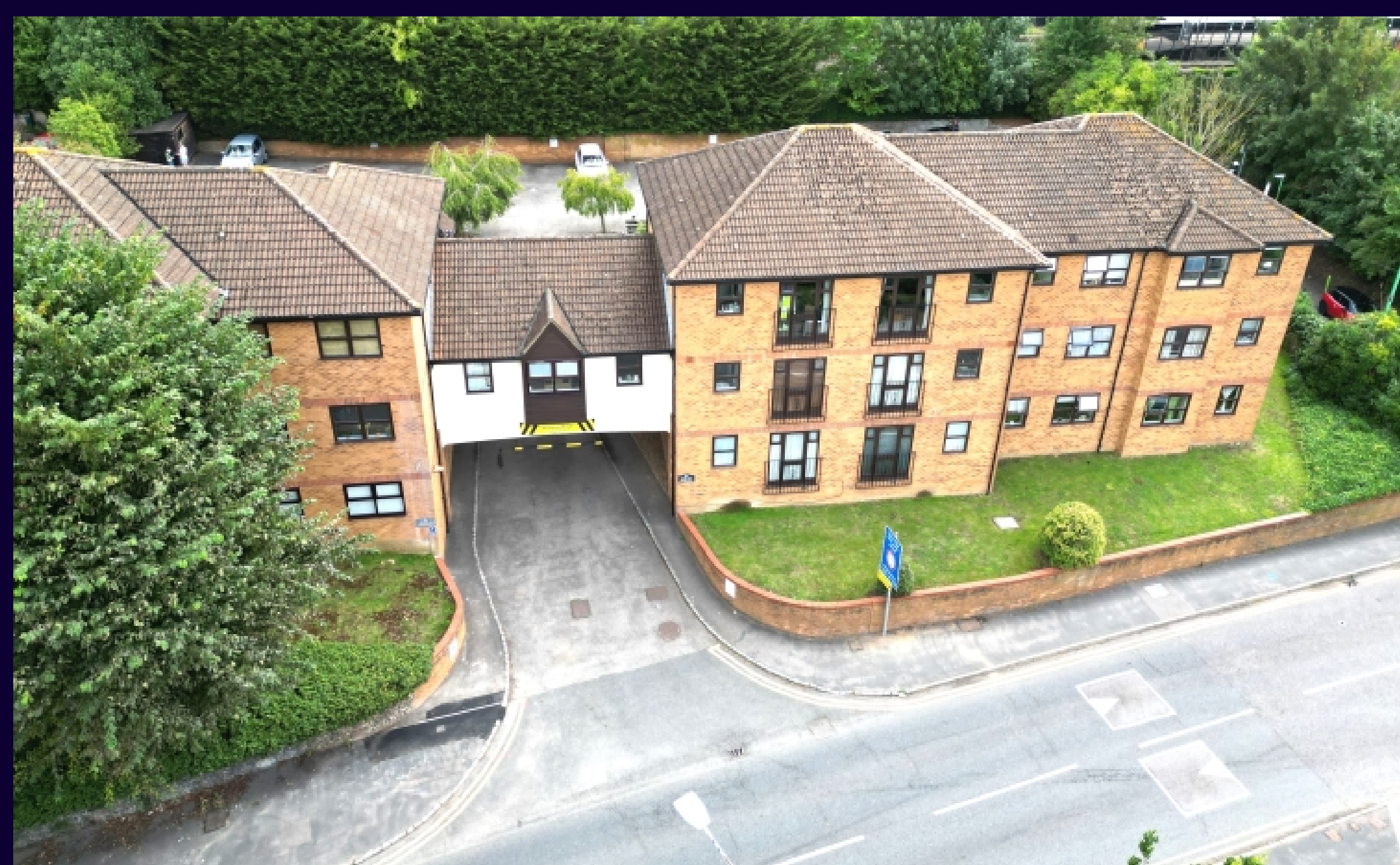
Station Approach, Station Road, Kings Langley, Hertfordshire, WD4 8SD