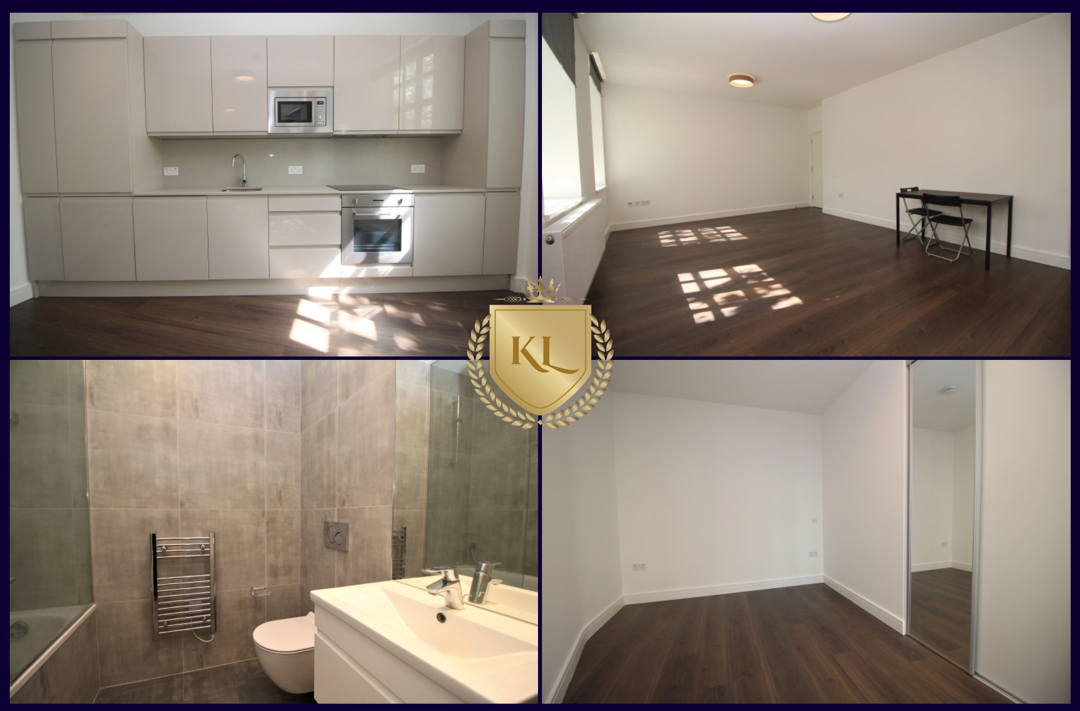
Kings Langley Estates wishes to inform prospective buyers and tenants that these particulars are a guide and act as information only. All our details are given in good faith and believed to be correct at the time of printing but they don't form part of an offer or contract. No employee of the company has authority to make or give and representation or warranty in relation to this property. All fixtures and fittings, whether fitted or not are deemed removable by the vendor unless stated otherwise and room sizes are measured between internal wall surfaces, including furnishings.