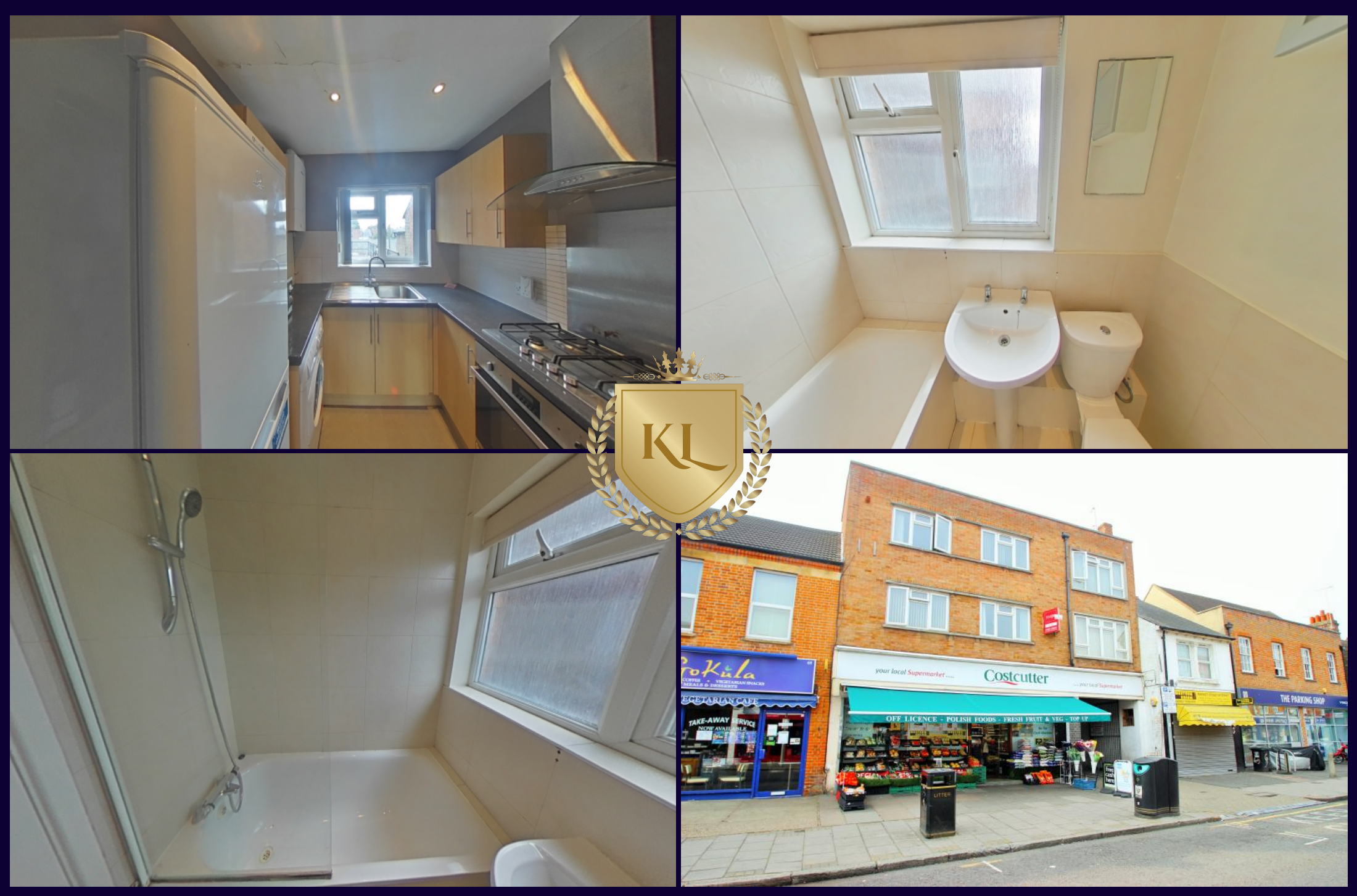
Kings Langley Estates wishes to inform prospective buyers and tenants that these particulars are a guide and act as information only. All our details are given in good faith and believed to be correct at the time of printing but they don't form part of an offer or contract. No employee of the company has authority to make or give and representation or warranty in relation to this property. All fixtures and fittings, whether fitted or not are deemed removable by the vendor unless stated otherwise and room sizes are measured between internal wall surfaces, including furnishings.