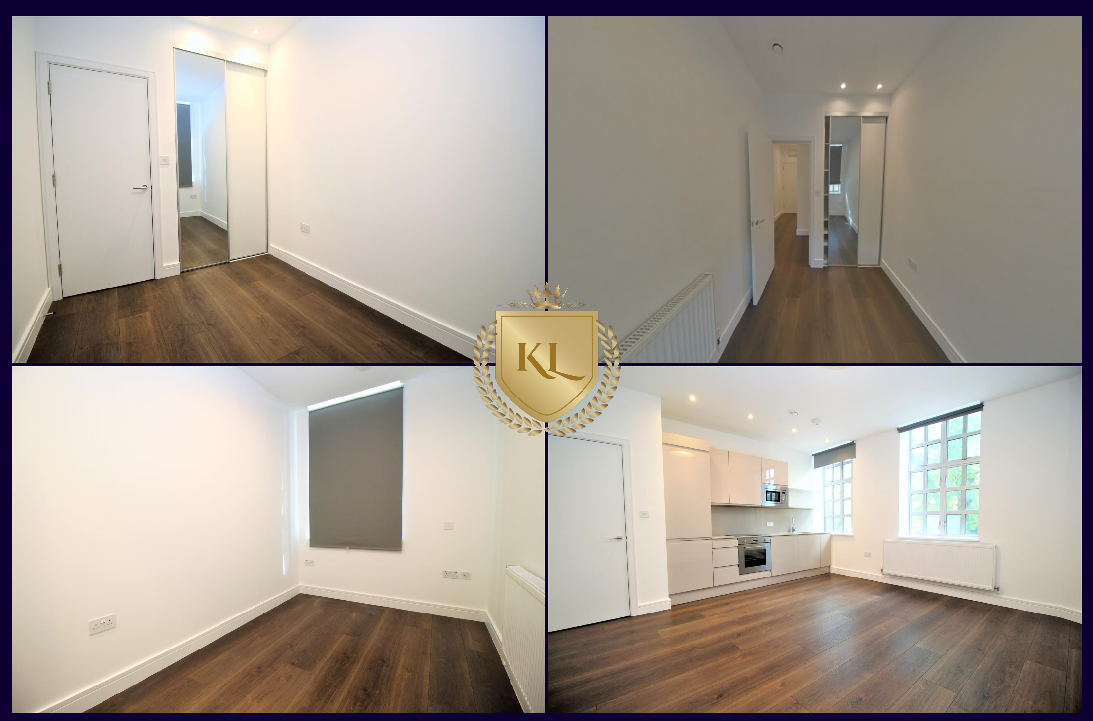
Kings Langley Estates wishes to inform prospective buyers and tenants that these particulars are a guide and act as information only. All our details are given in good faith and believed to be correct at the time of printing but they don't form part of an offer or contract. No employee of the company has authority to make or give and representation or warranty in relation to this property. All fixtures and fittings, whether fitted or not are deemed removable by the vendor unless stated otherwise and room sizes are measured between internal wall surfaces, including furnishings.