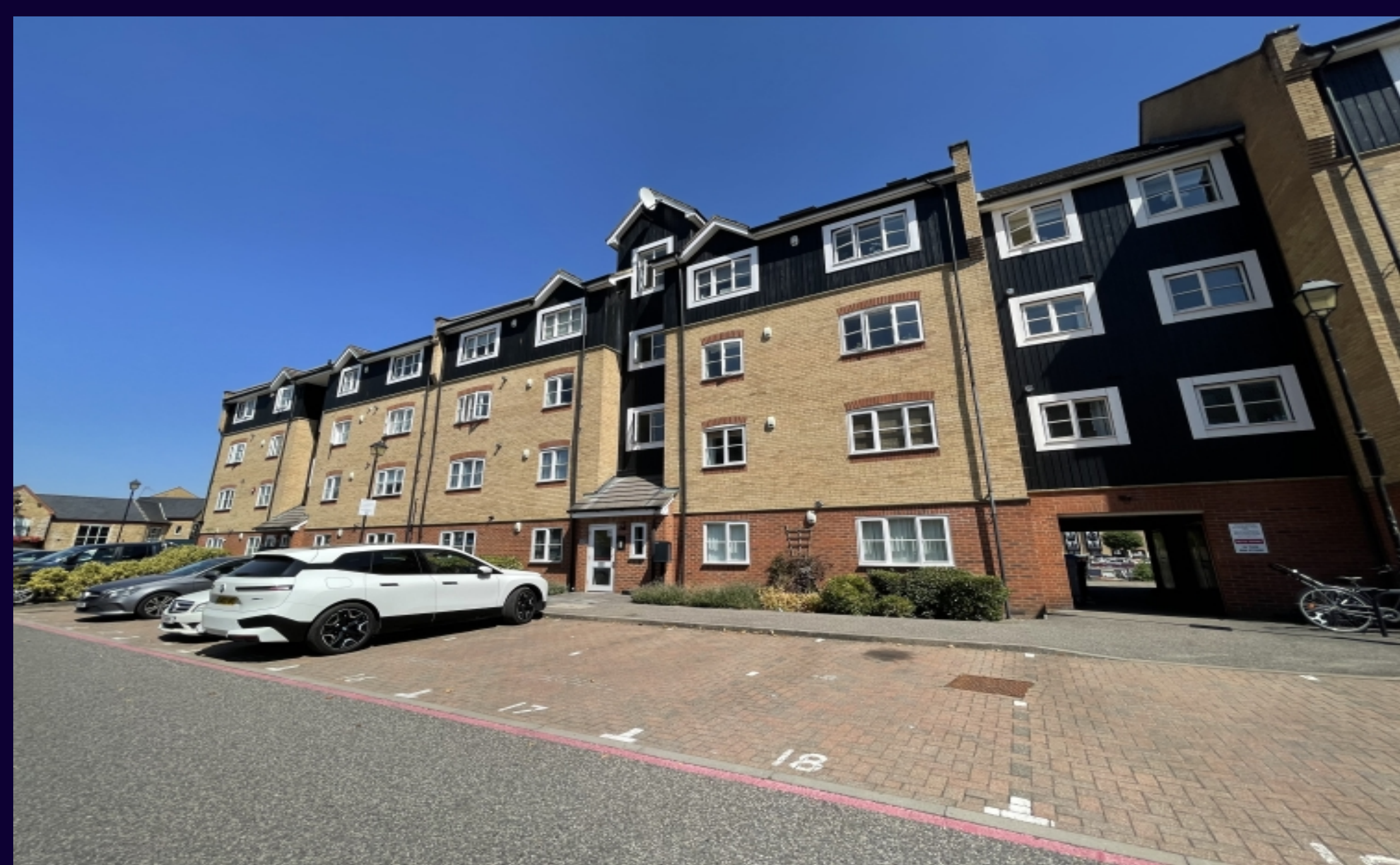
Longman Court Stationers Place, Hemel Hempstead, Hertfordshire, HP3