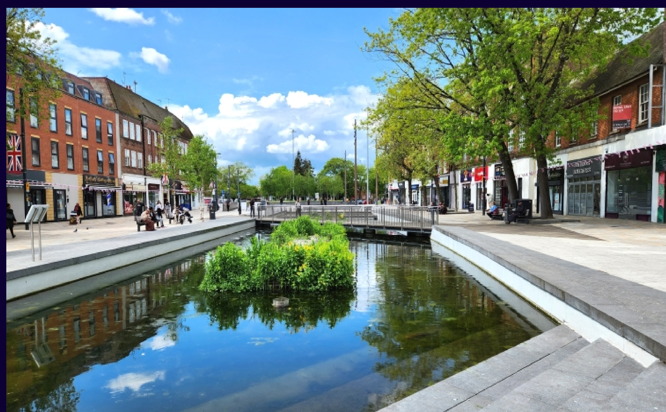
The Parade, High Street, Watford, WD17 1BS