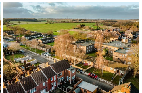
Long House North Street, South Kirkby, Pontefract, West Yorkshire, WF9 3LX