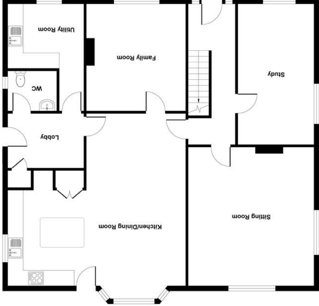
Ground Floor Approximate Floor Area 1453 sq. ft (134.98 sq. m)

Approx. Gross Internal Floor Area 2313 sq. ft / 214.87 sq. m