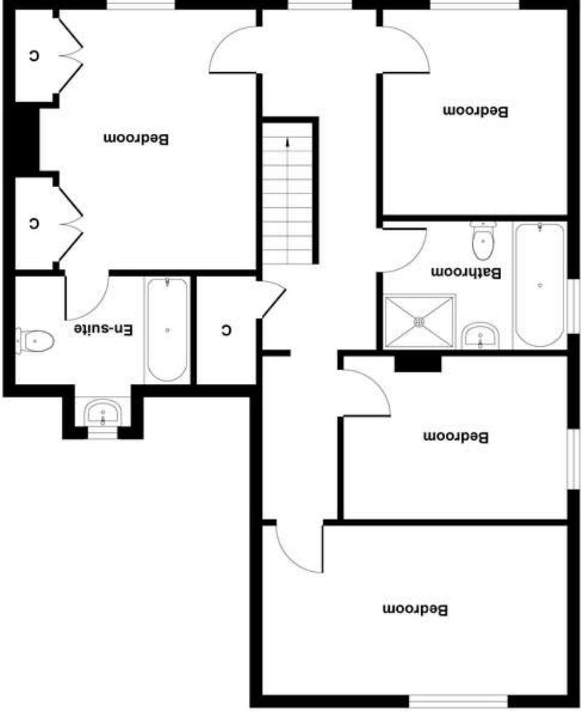
First Floor Approximate Floor Area 860 sq. ft (79.89 sq. m)

Approx. Gross Internal Floor Area 2313 sq. ft / 214.87 sq. m