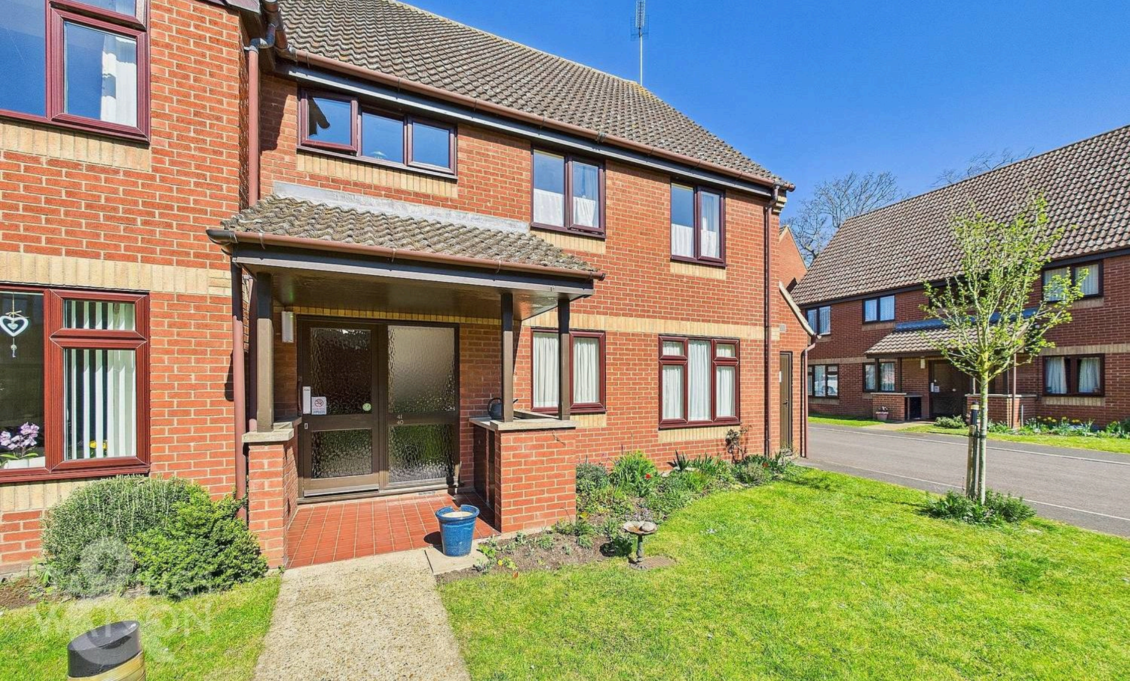
Parkside Court, Diss - IP22 4NJ