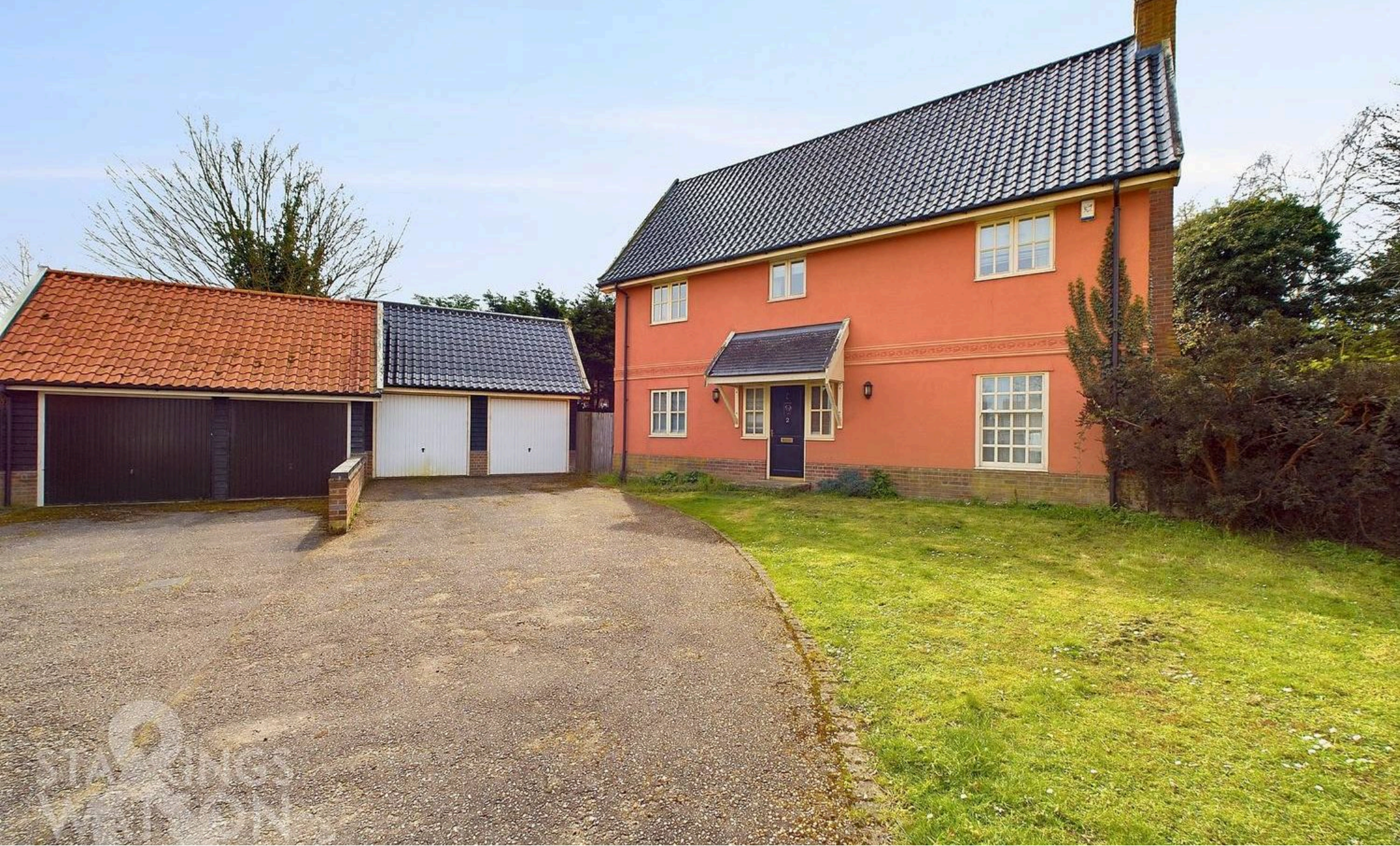
Linden Court, Eye - IP23 7DU