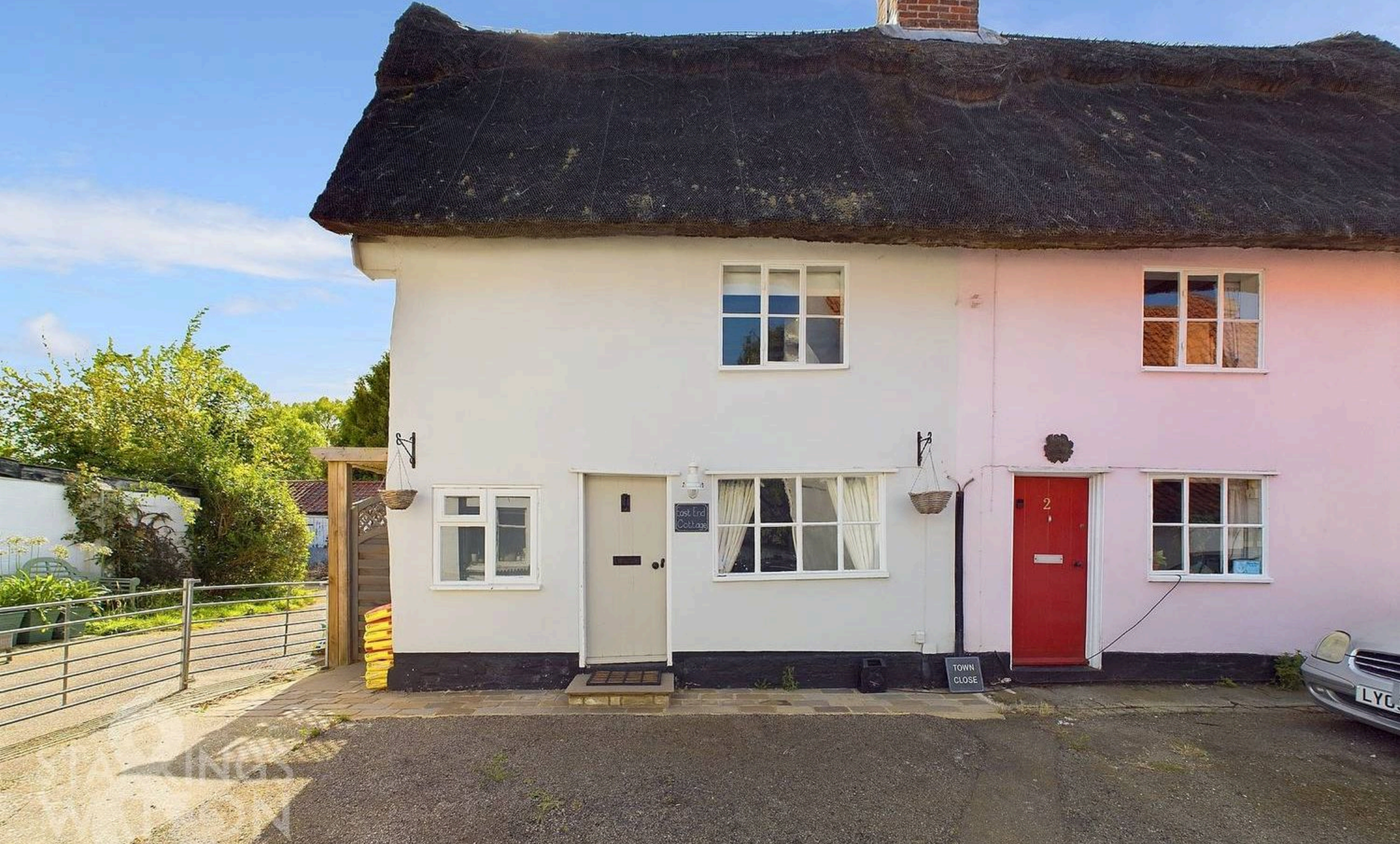
Town Close Church Street, Stradbroke - IP21 5HS