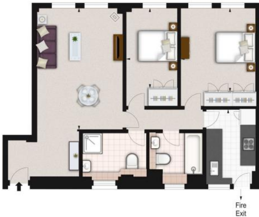
ILLUSTRATION FOR IDENTIFICATION PURPOSES ONLY. NOT TO SCALE * As Defined by RICS - Code of Measuring Practice

APPROX. GROSS INTERNAL AREA * 721 Ft 2 - 66.98 M 2