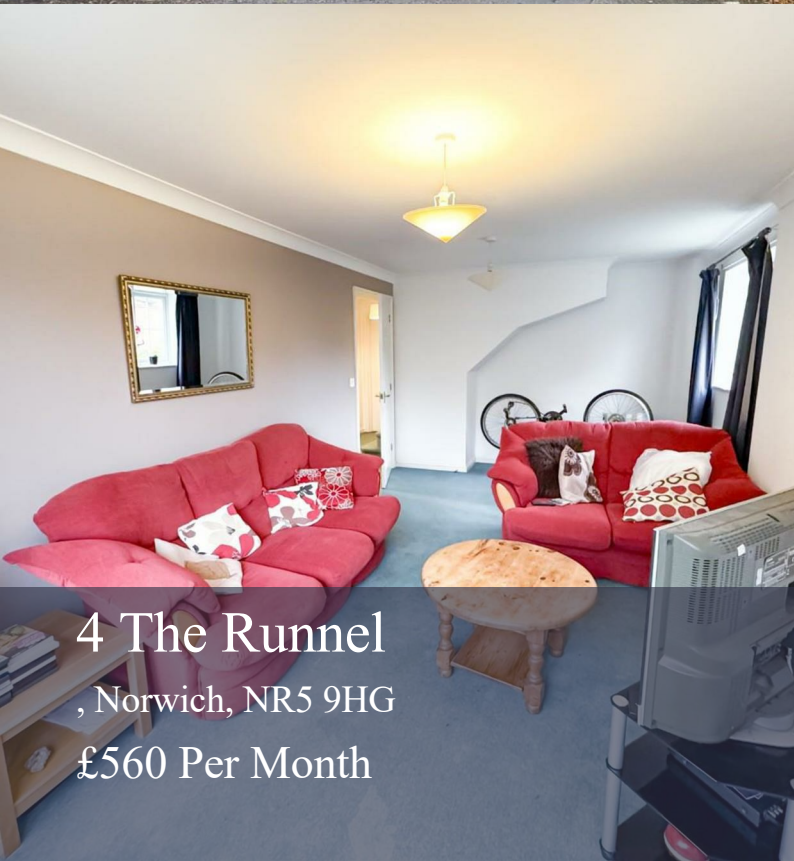
4 The Runnel , Norwich, NR5 9HG £560 Per Month