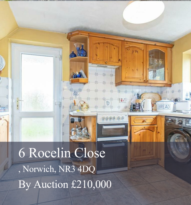
6 Rocelin Close , Norwich, NR3 4DQ By Auction £210,000