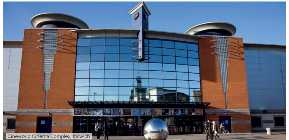
Cineworld Cinema Complex, Ipswich