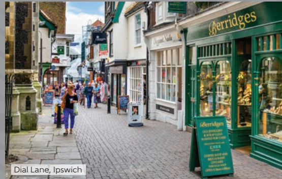
Dial Lane, Ipswich

Ridley's Orchard is perfectly placed on the doorstep of Ipswich town centre, with its many amenities catering to daily life, including a selection of post offices, surgeries, veterinarians, hairdressers and banks.