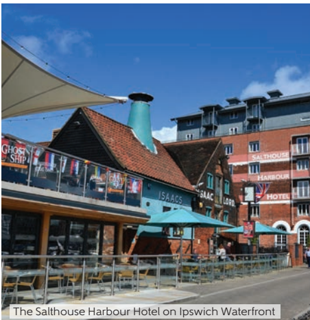
The Salthouse Harbour Hotel on Ipswich Waterfront

suit first-time buyers and downsizers, who will both enjoy the elements of a brand new home. It's also ideal for families seeking well-regarded schools and garden spaces, as well as commuters, both locally and further afield to areas including Colchester, Bury St Edmunds, Chelmsford and London.