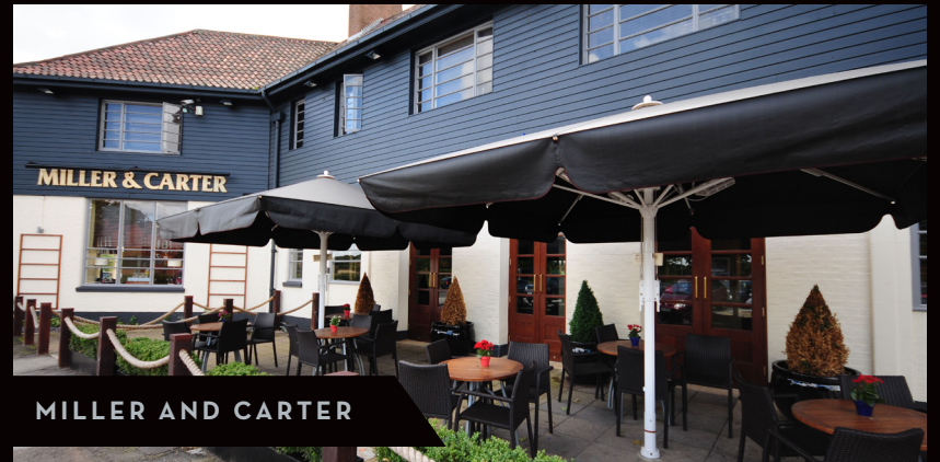
MILLER AND CARTER