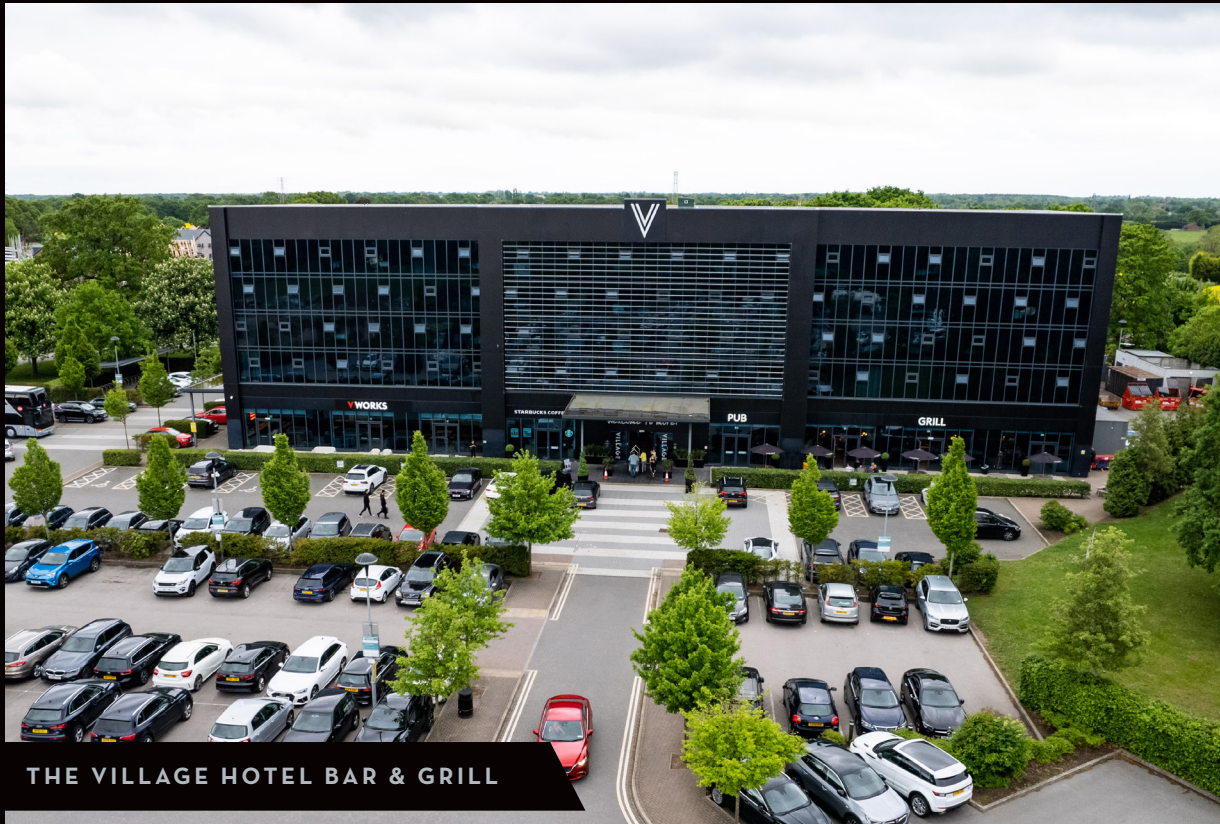
THE VILLAGE HOTEL BAR & GRILL