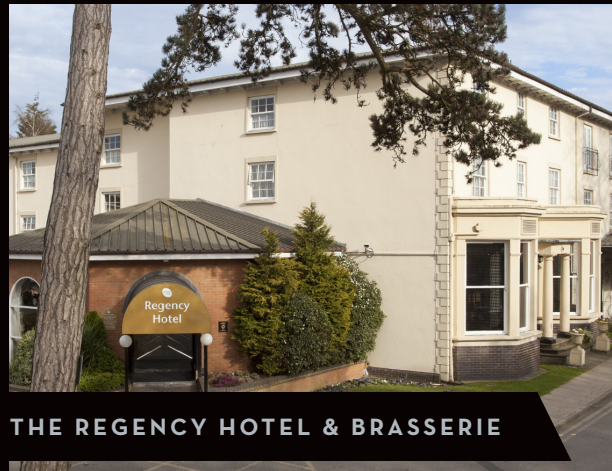
THE REGENCY HOTEL & BRASSERIE