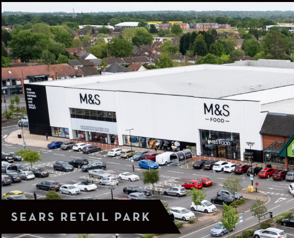
SEARS RETAIL PARK