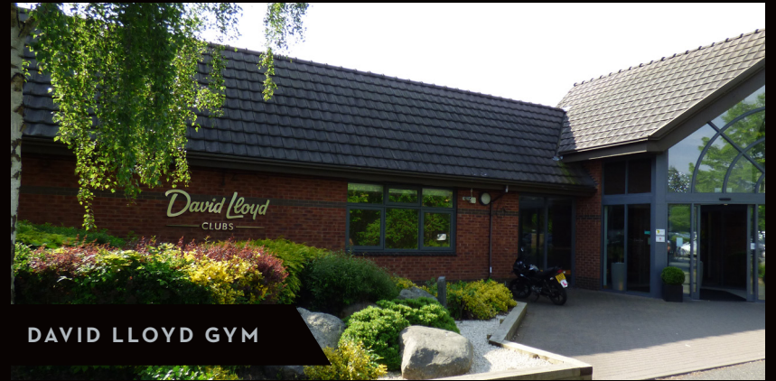
DAVID LLOYD GYM