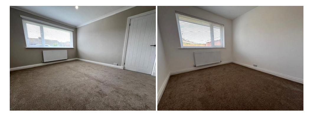
Bedroom Two - 9' 10" x 8' 10" (2.99m x 2.69m)

With uPVC double glazed window to the front, radiator and ceiling light.