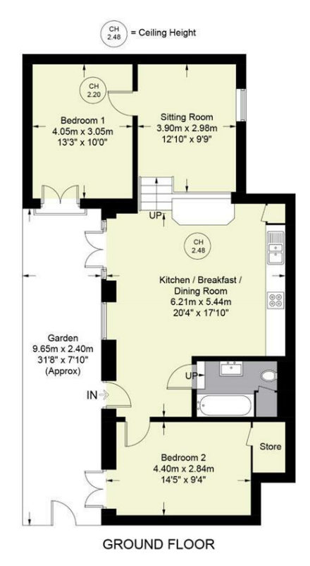
Floor Plan produced for Hursts by Media Arcade ©. Illustration for identification purposes only. Window and door openings are approximate. Whilst every attempt is made to assure accuracy in the preparation of this plan, please check all dimensions, shapes and compass bearings before making any decisions reliant upon them.