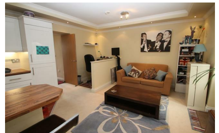
Flat 8, Cricket View 123 London Road, High Wycombe,

Estate Agents ~ Lettings Agents ~ Valuers ~ Independent Mortgage Advisors