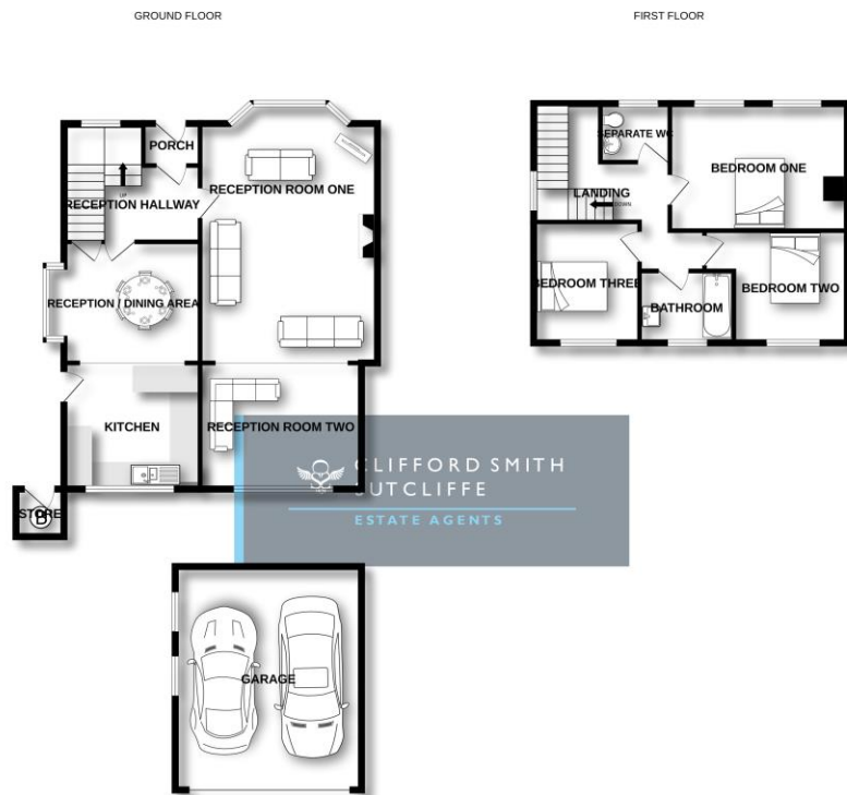
THREE BEDROOM SEMI-DETACHED HOUSE

Whilst every attempt has been made to ensure the accuracy of the floorplan contained here, measurements of doors, windows, rooms and any other items are approximate and no responsibility is taken for any error, omission or mis-statement. This plan is for illustrative purposes only and should be used as such by any prospective purchaser. The services, systems and appliances shown have not been tested and no guarantee as to their operability or efficiency can be given. Made with Metropix 02024