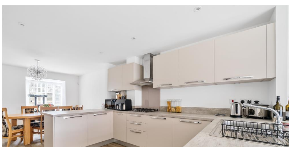
On the ground floor, soft-close units in the kitchen are complemented by a selection of integrated appliances, comprising a gas hob, electric fan oven, chimney hood, dishwasher, and fridge freezer. A utility room, which is situated off the kitchen, contains space for a washing machine and provided direct access to the rear garden.

The dual-aspect Kitchen/living/dining room provides great entertaining space for the family with French doors leading out to the garden. There is a separate living room with French doors to the rear garden. A study and downstairs WC complete the ground floor accommodation.