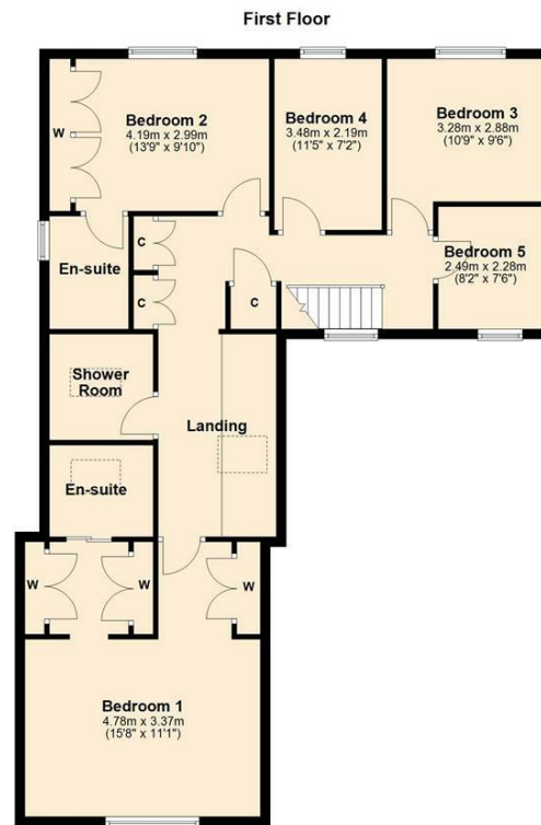
3 Spinney Close, Hitchin