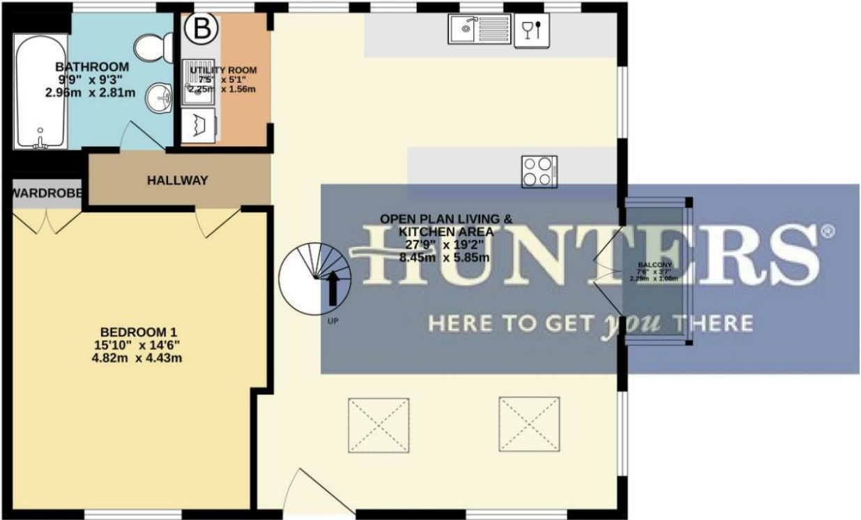
GROUND FLOOR 949 sq.ft. (88.1 sq.m.) approx.