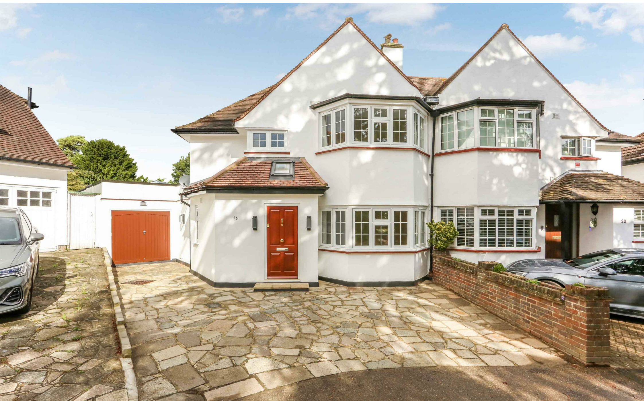
THE GALLOR, SM2

TOTAL APPROX FLOOR PLAN AREA INCLUDING GARAGE 1629 SQ.FT (151 SQ.M) TOTAL APPROX FLOOR PLAN AREA EXCLUDING GARAGE 1588 SQ.FT (147 SQ.M)