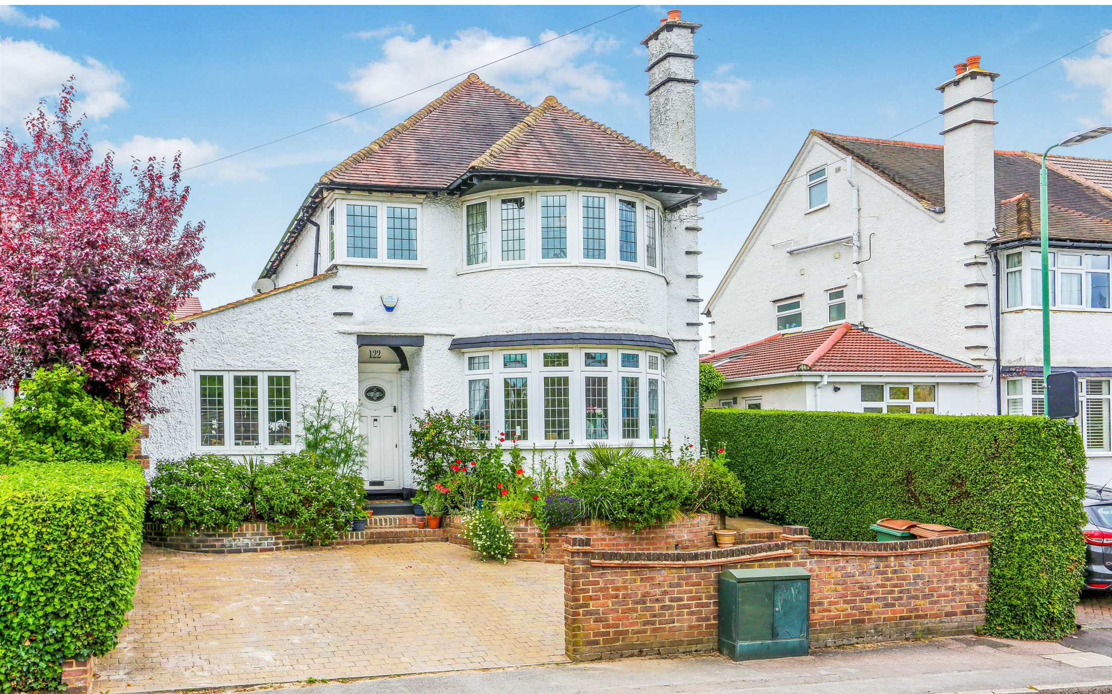
SANDY LANE, SM6