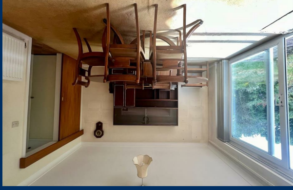
17, Tree Tops Avenue, Camberley, GU15 3UT