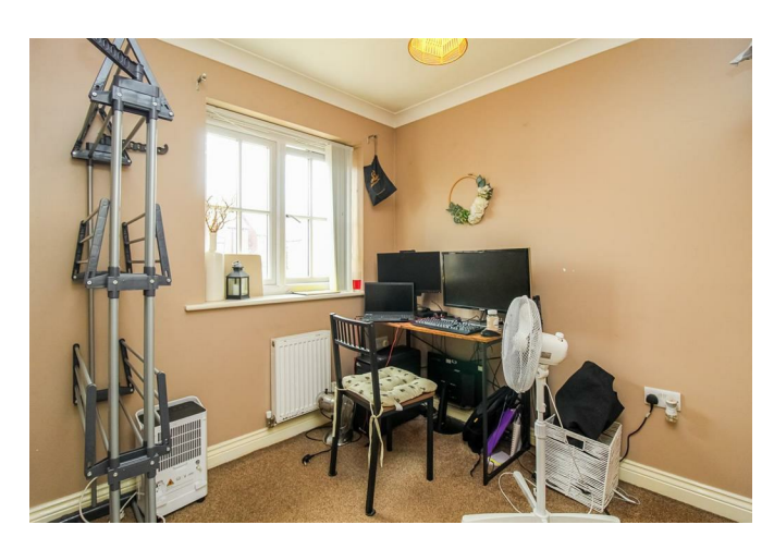
BEDROOM THREE 6'10" x 6'2" (2.1m x 1.9m)

Window overlooking the rear garden and central heating radiator.