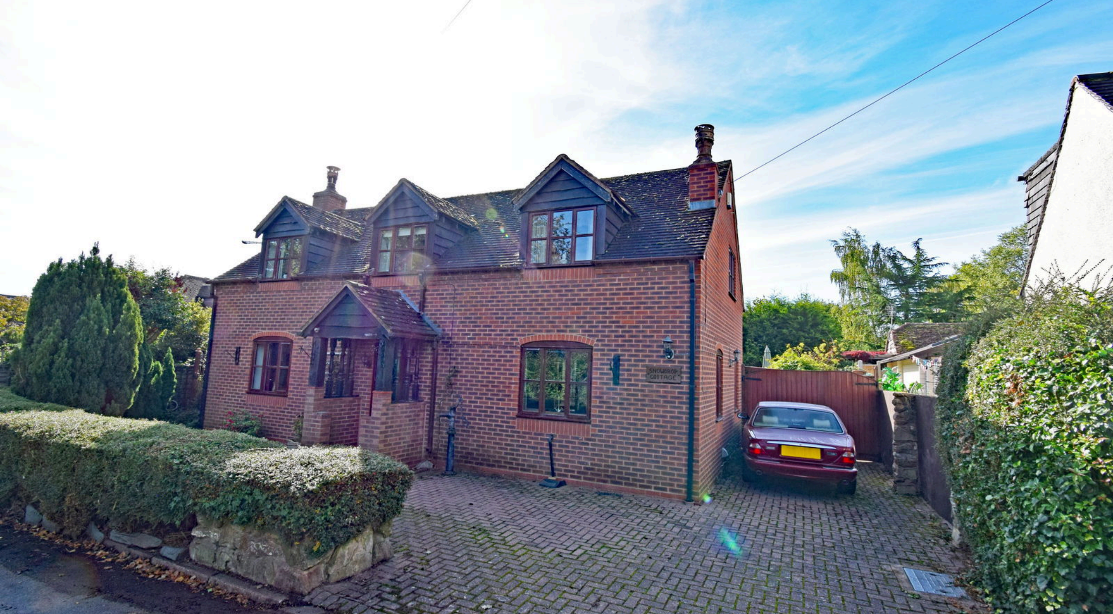
Snowdrop Cottage, Addis Lane, Cutnall Green, Worcestershire, WR9 0NB