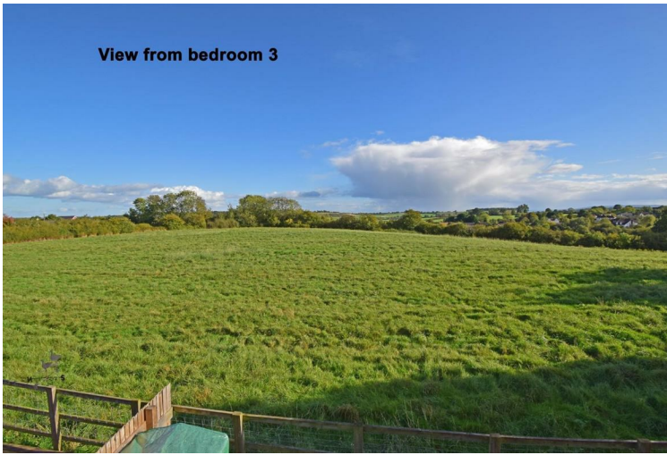
View from bedroom 3