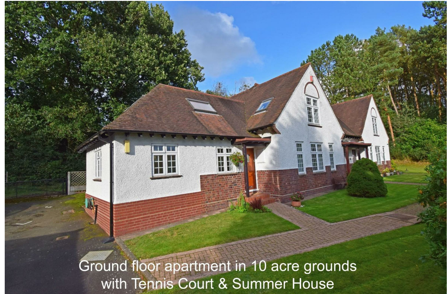
Ground floor apartment in 10 acre grounds with Tennis Court & Summer House

45 Romsley Hill Grange, Farley Lane, Romsley, Worcestershire, B62 0LN