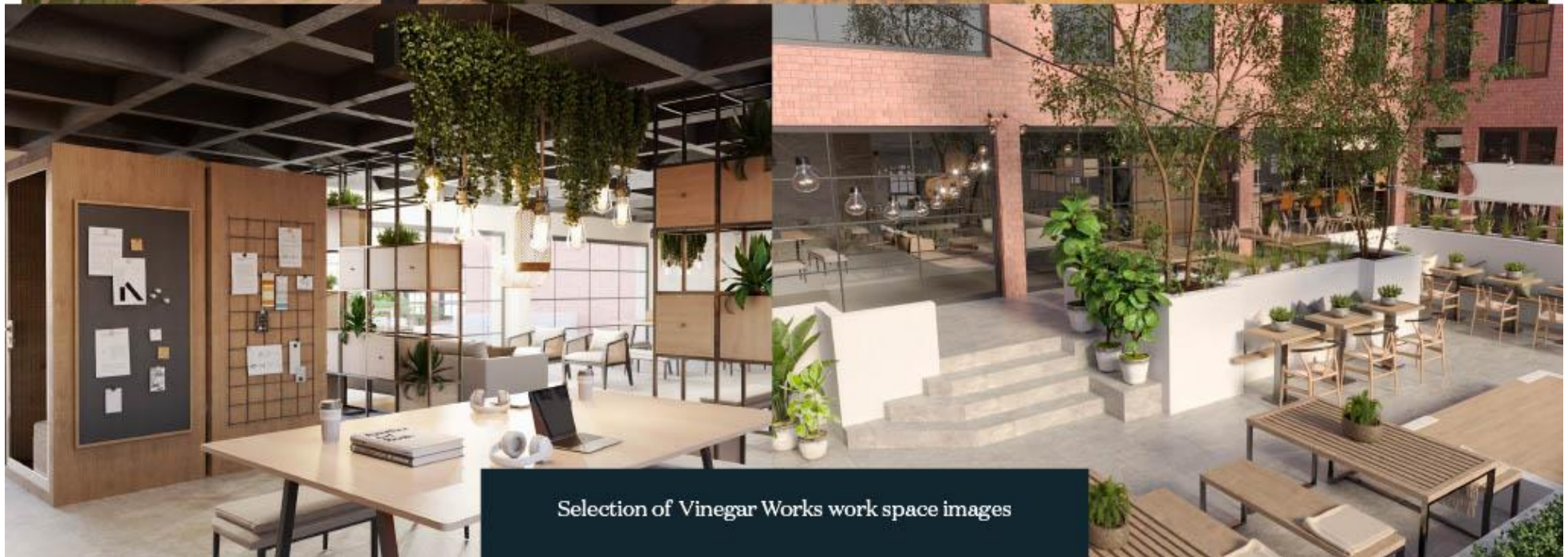
Selection of Vinegar Works work space images