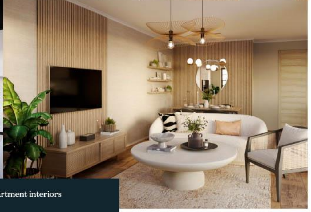
Selection of apartment interiors