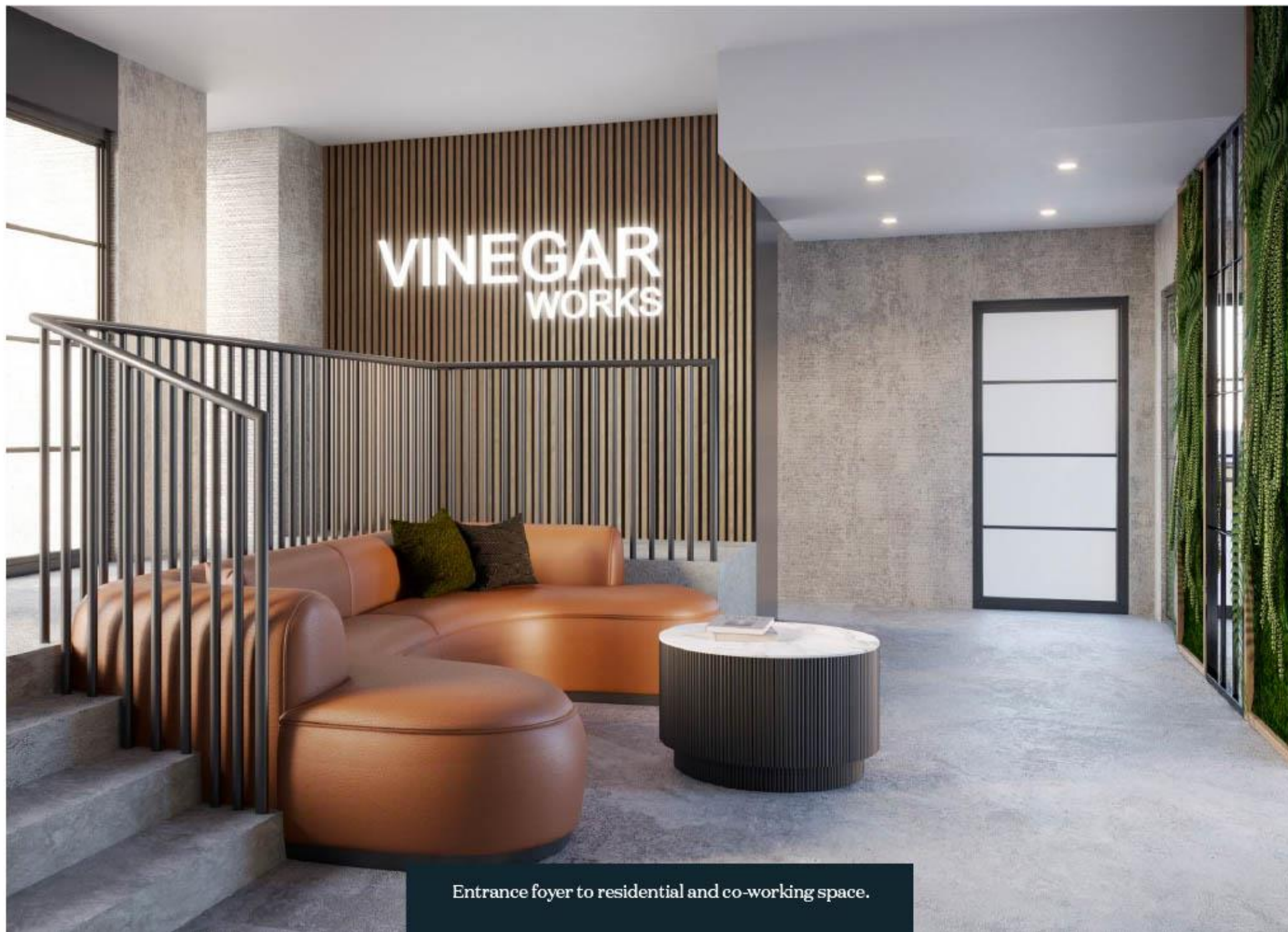
Entrance foyer to residential and co-working space.