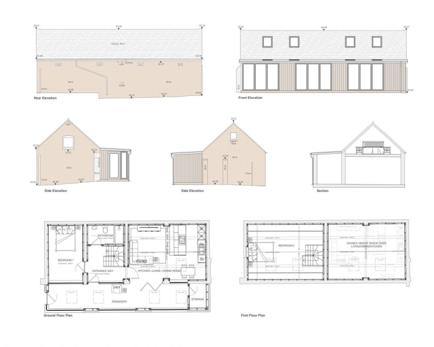
Proposed Plans, Elevations and Section - Scale 1:50 @ A1