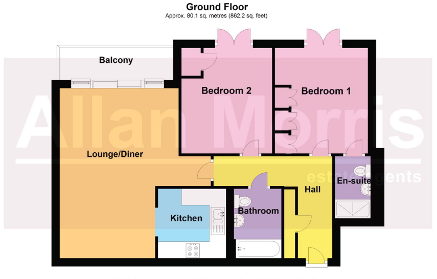
Total area: approx. 80.1 sq. metres (862.2 sq. feet)