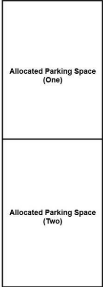
Two Allocated Parking Spaces Located Behind Block In Car Park