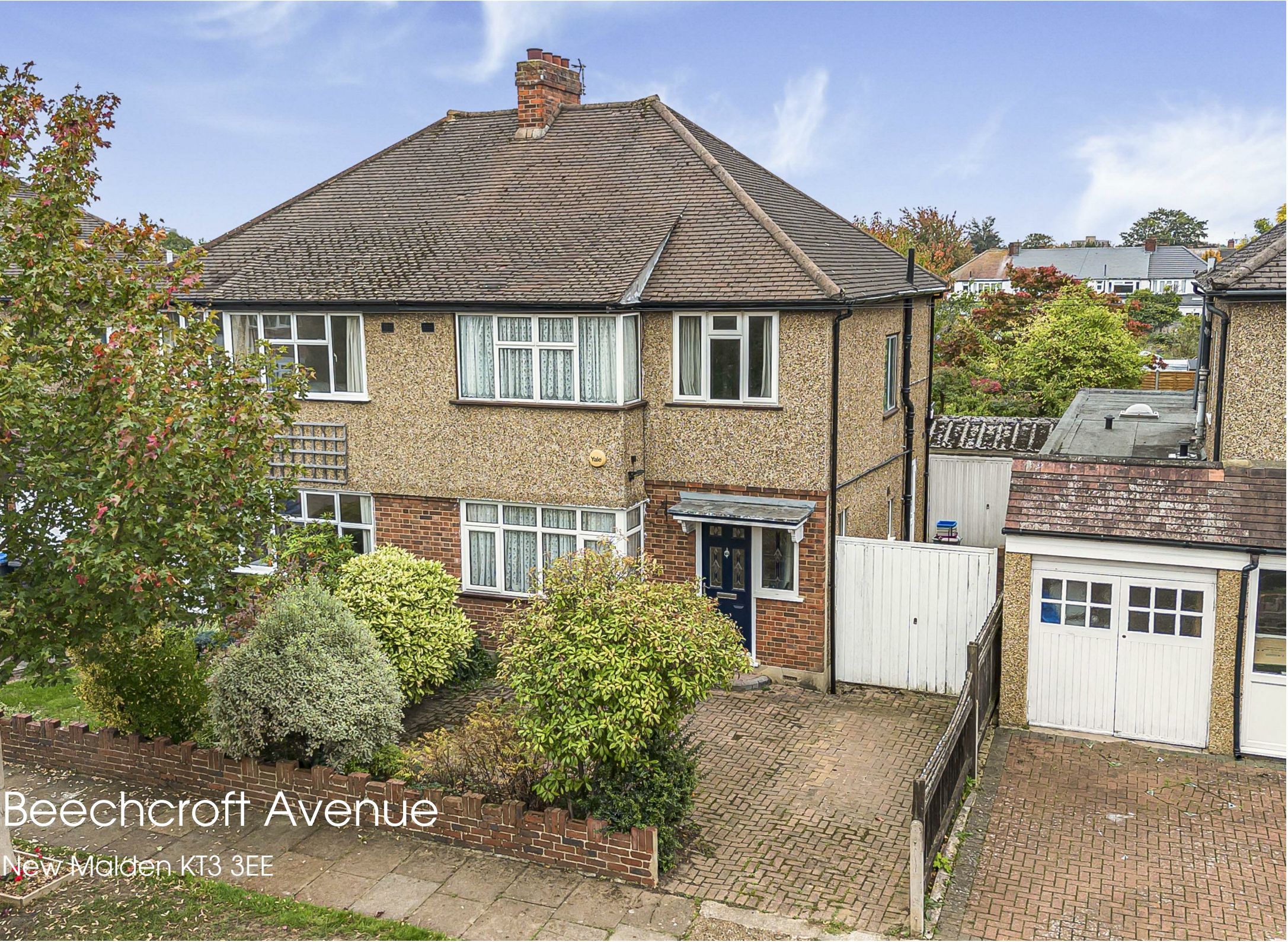
Beechcroft Avenue New Malden KT3 3EE

Approximate Gross Internal Area 1200 sq ft - 111 sq m (Including Garage) Ground Floor Area 521 sq ft - 48 sq m First Floor Area 518 sq ft - 48 sq m Garage Area 161 sq ft - 15 sq m