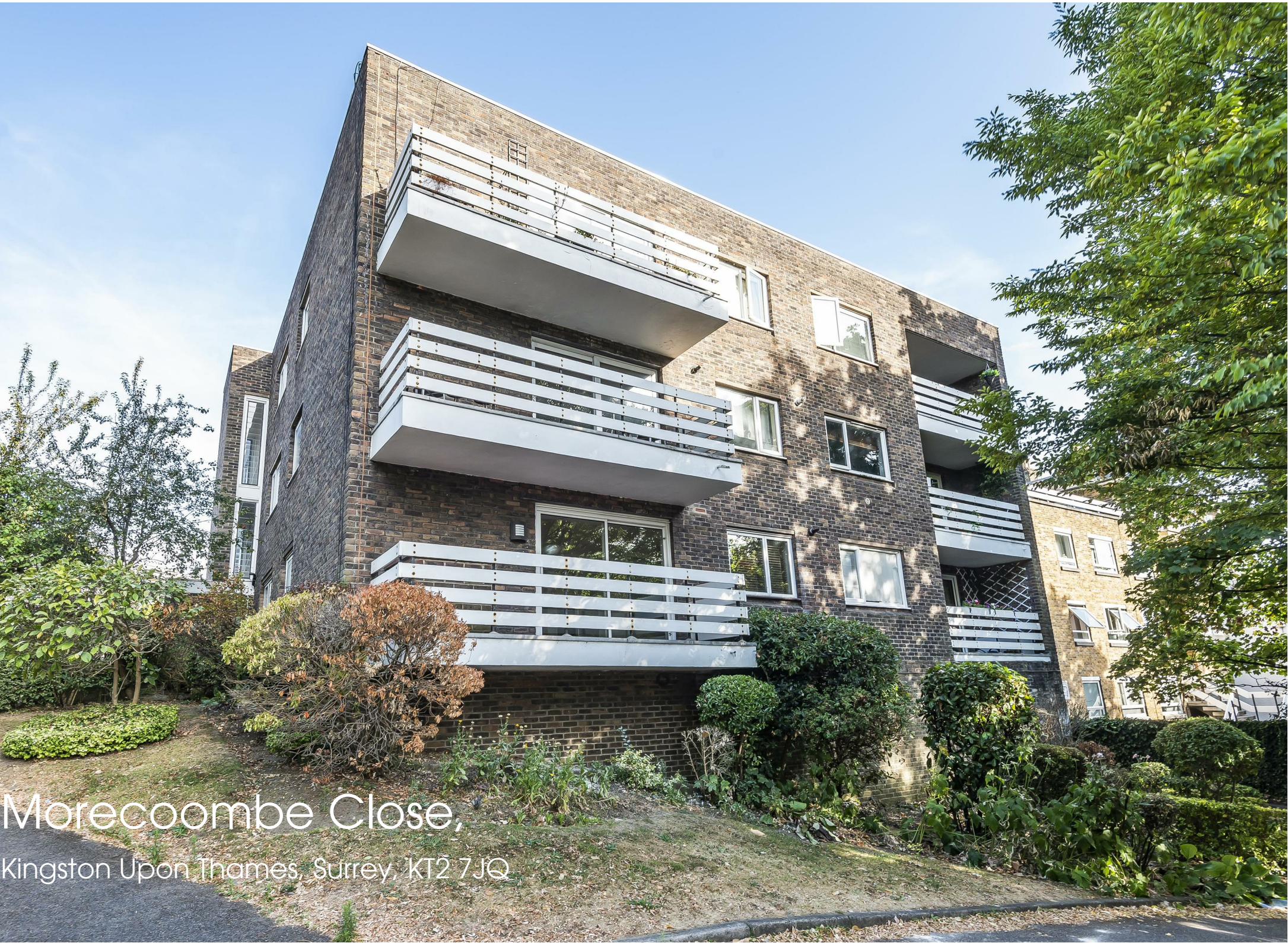
Morecoombe Close, Kingston Upon Thames, Surrey, KT2 7JQ