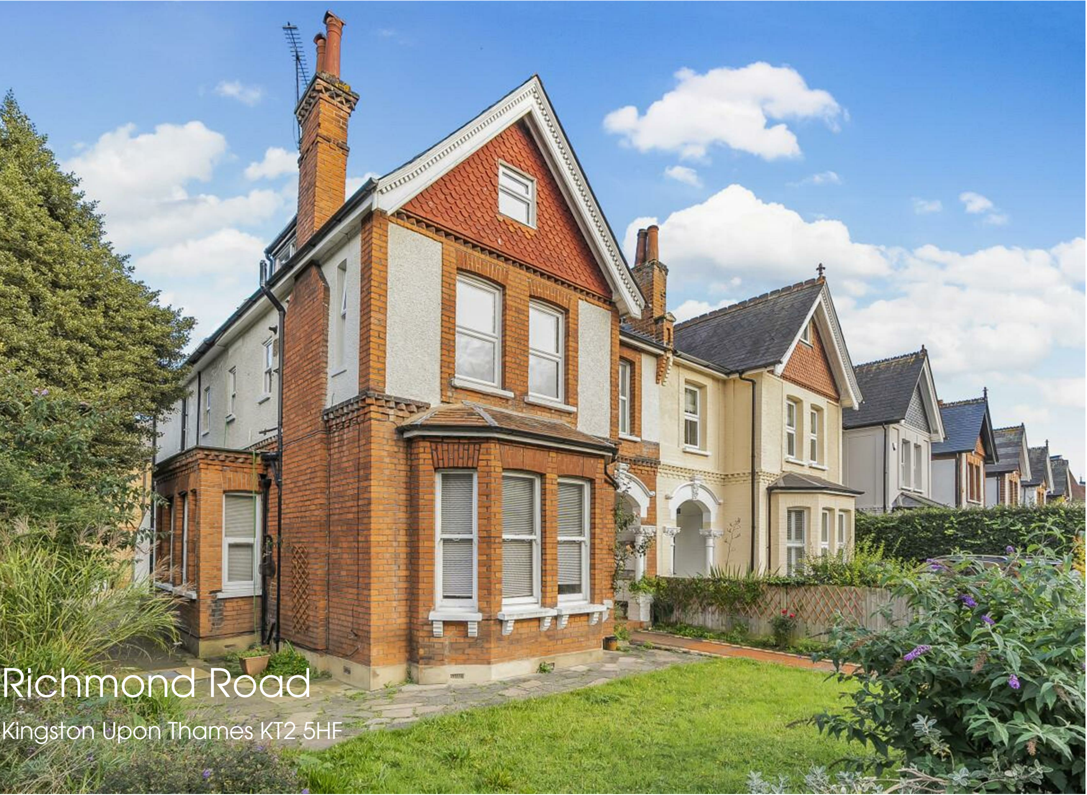
Richmond Road Kingston Upon Thames KT2 5HF