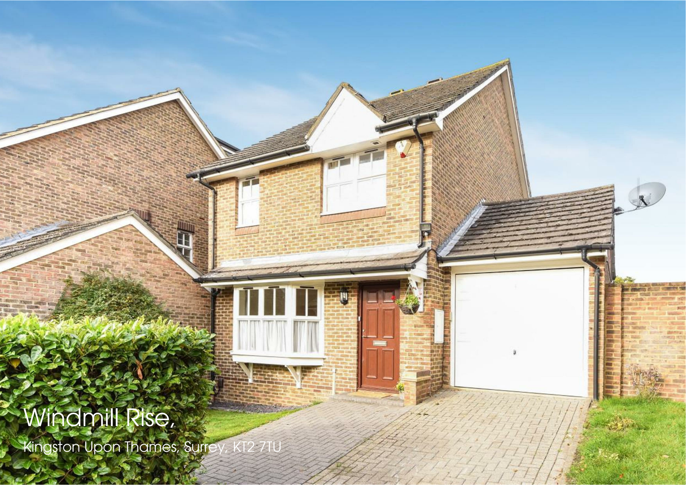
Windmill Rise, Kingston Upon Thames, Surrey, KT2 7TU