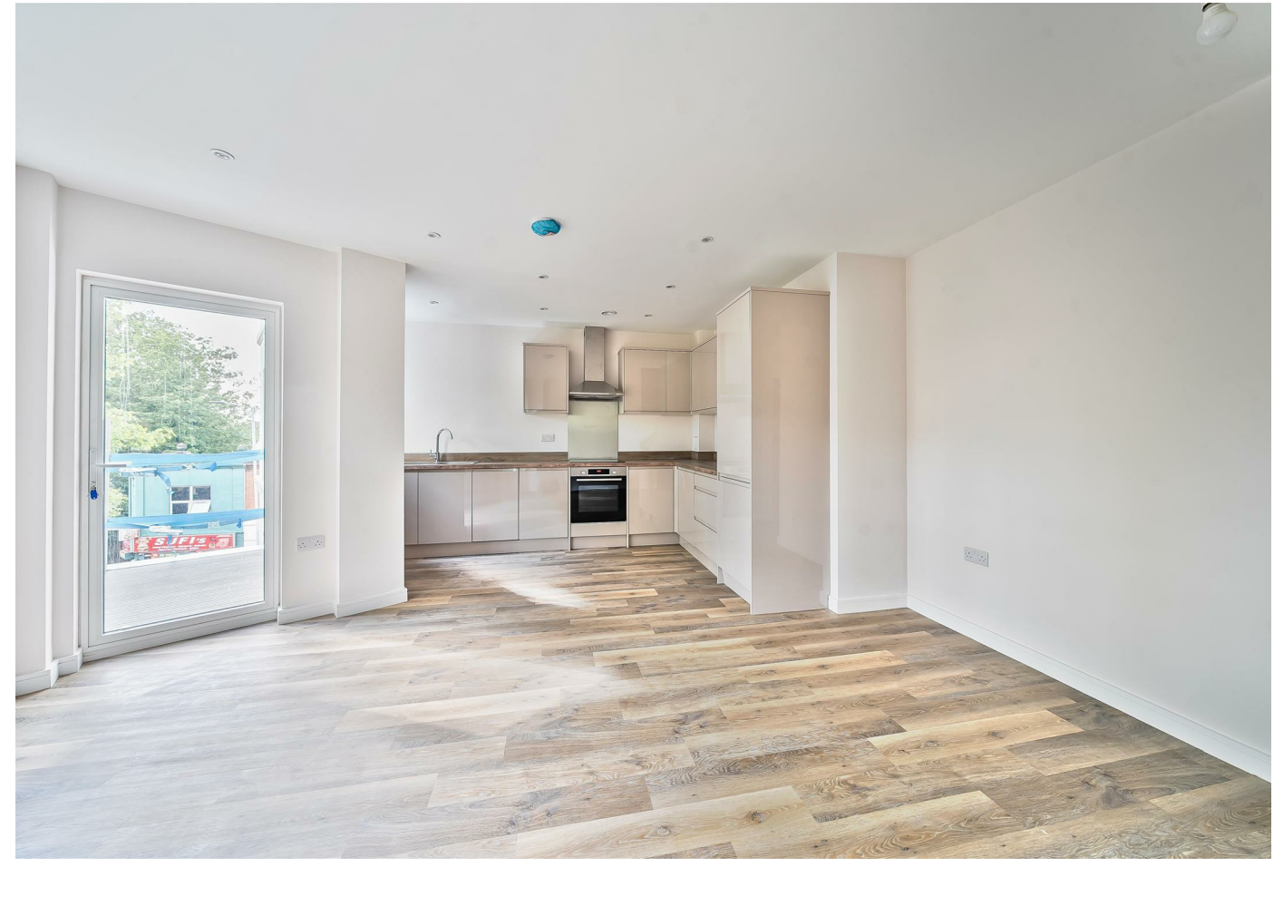
£1,850 Per Calendar Month

192-194 London Road, Kingston Upon Thames, Surrey, KT2 6QP