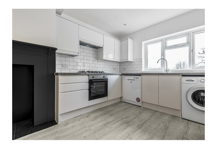
£2,300 Per Calendar Month

Richmond Road, Kingston Upon Thames, Surrey, KT2 5QU