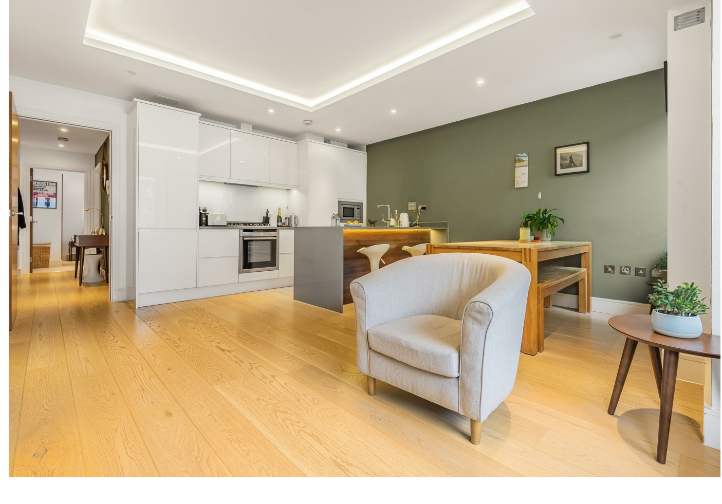
£2,400 Per Calendar Month

67-69 Maple Road, Surbiton, Surrey, KT6 4AG