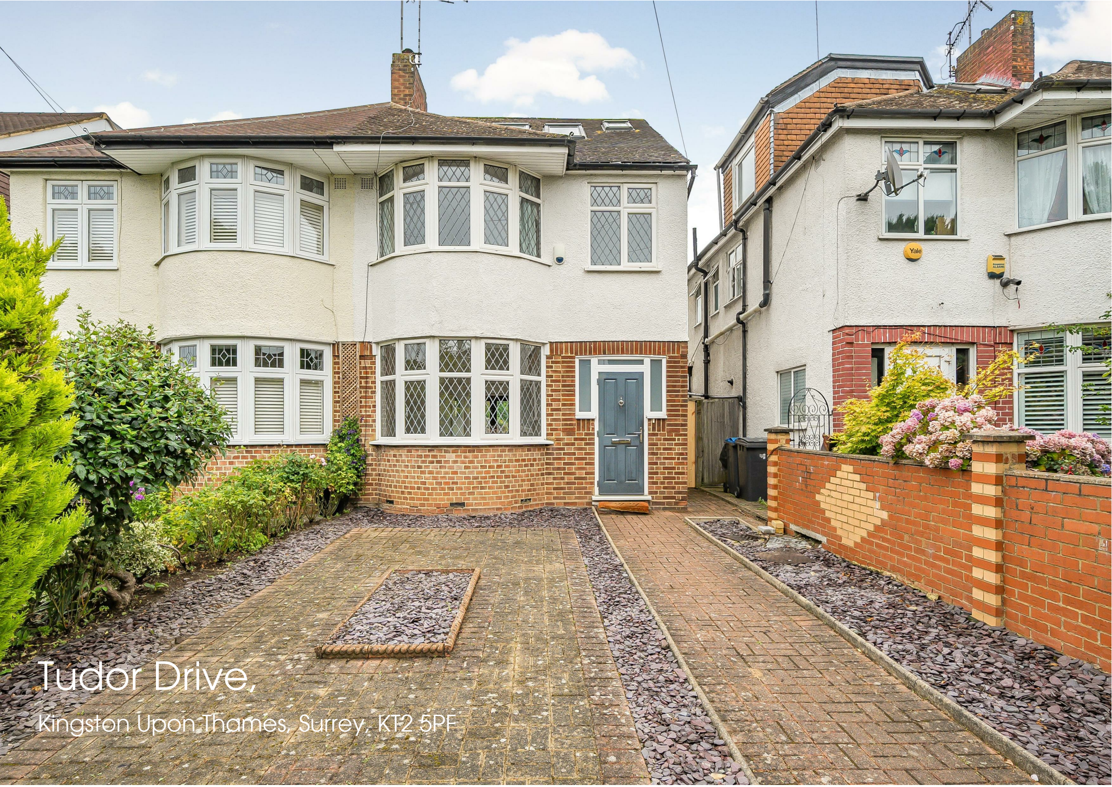
Tudor Drive, Kingston Upon Thames, Surrey, KT2 5PF