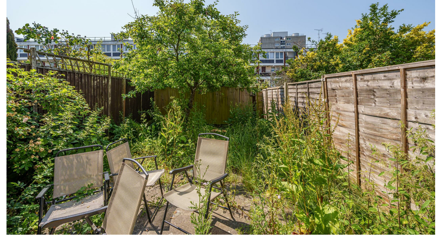
£2,500 Per Calendar Month

Sherfield Gardens, Roehampton, London, SW15 4PA