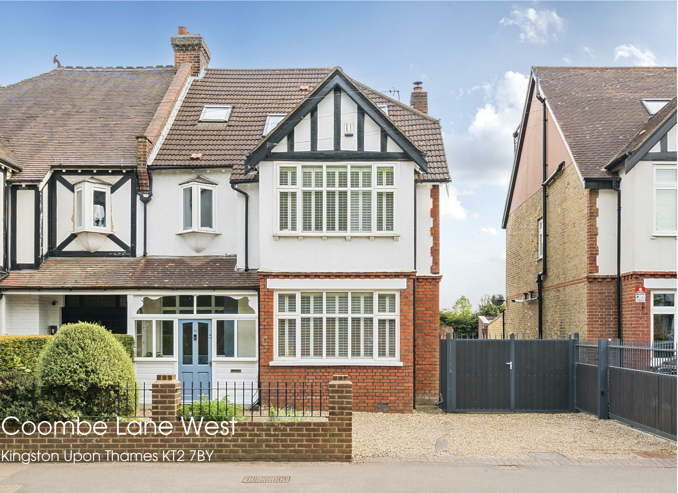
Coombe Lane West Kingston Upon Thames KT2 7BY